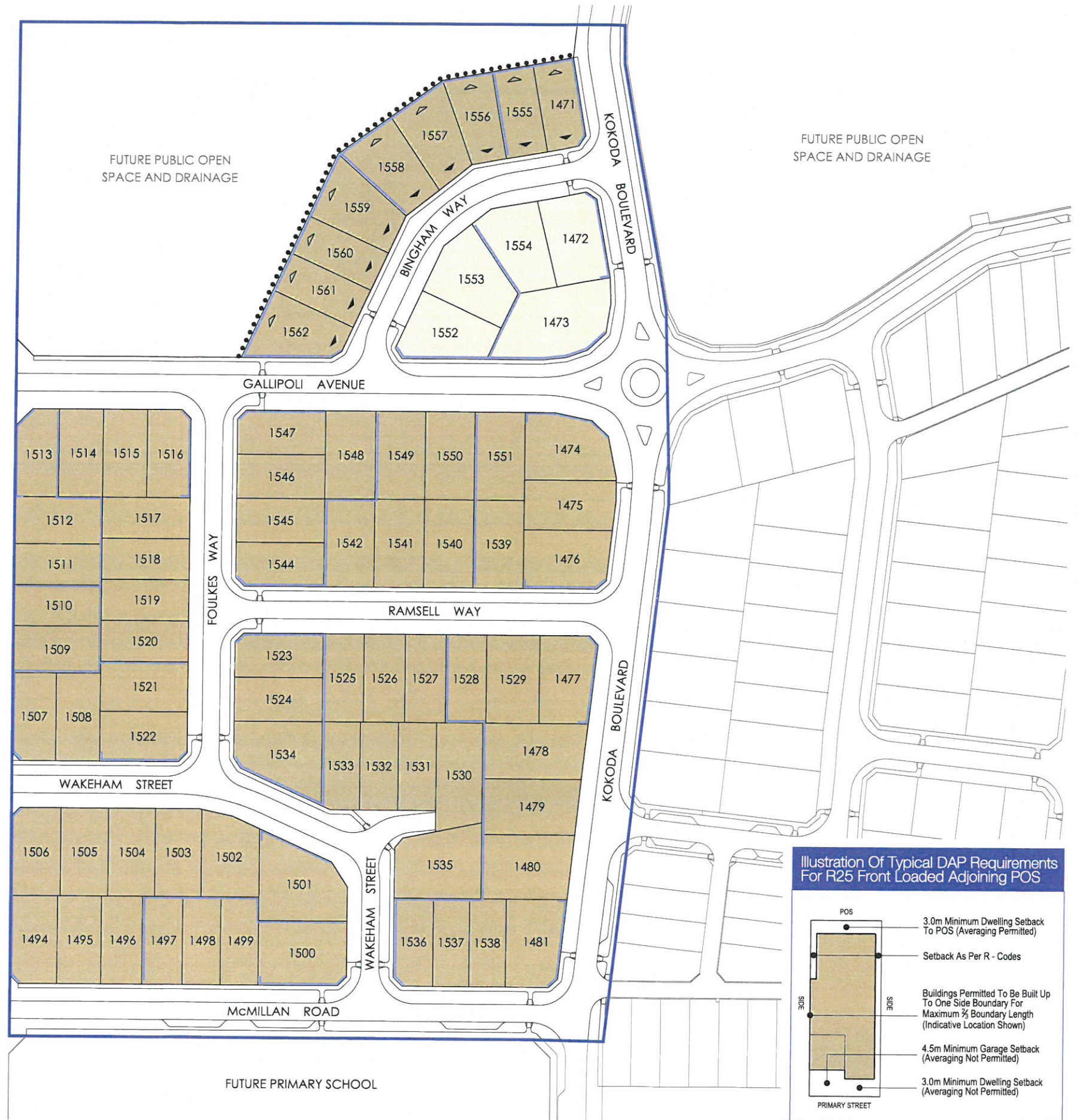
Illustration Of Typical DAP Requirements For R25 Front Loaded Adjoining POS