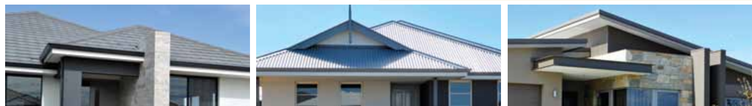
Low profile tiles Corrugated Metal Deck Roof Skillion Roof