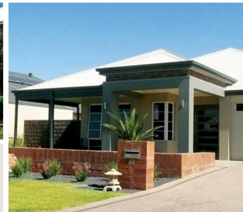
Examples of homes that express the theme for The Glades