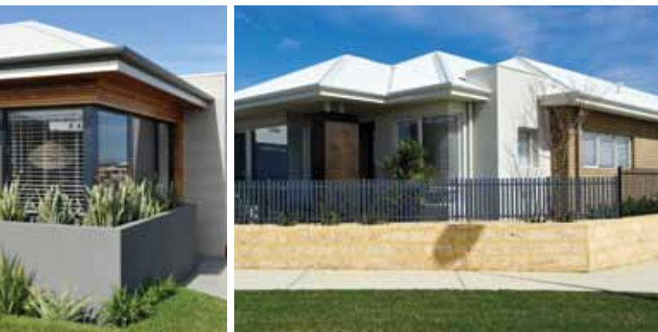
Corner window Articulation and continuation of materials